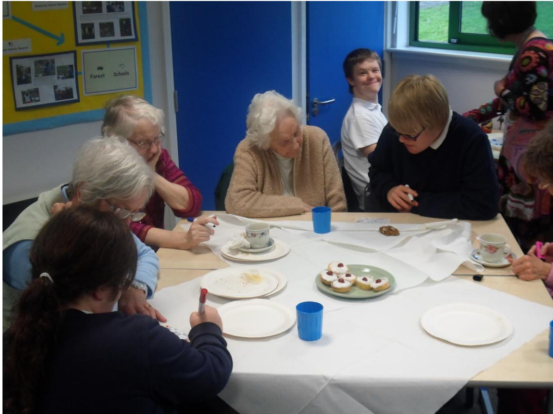
Here some KS4 pupils are entertaining Age Concern visitors to the College site.

We have close links with local Further Education Colleges and 6 th form provision, and offer integration opportunities to pupils of all ages, where appropriate. The school's ethos of being a valuable part of the Mid Sussex Community will be reflected in a curriculum for pupils, which aims to help each of them play a full part in their local community. Ideas we are exploring at present include offering wider range of NVQ vocational qualifications, and specialist qualifications including in RHS gardening courses, opportunities in retail and other areas.