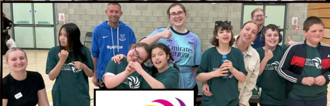
Table Cricket: Superb team spirit, encouragement and support for one another throughout!